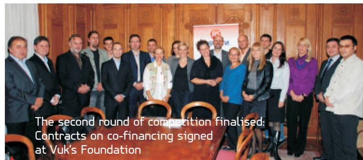
The second round of competition finalised: Contracts on co-financing signed at Vuk's Foundation